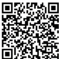
Tax Collector's Website: