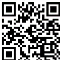
Property Tax Bill Online: