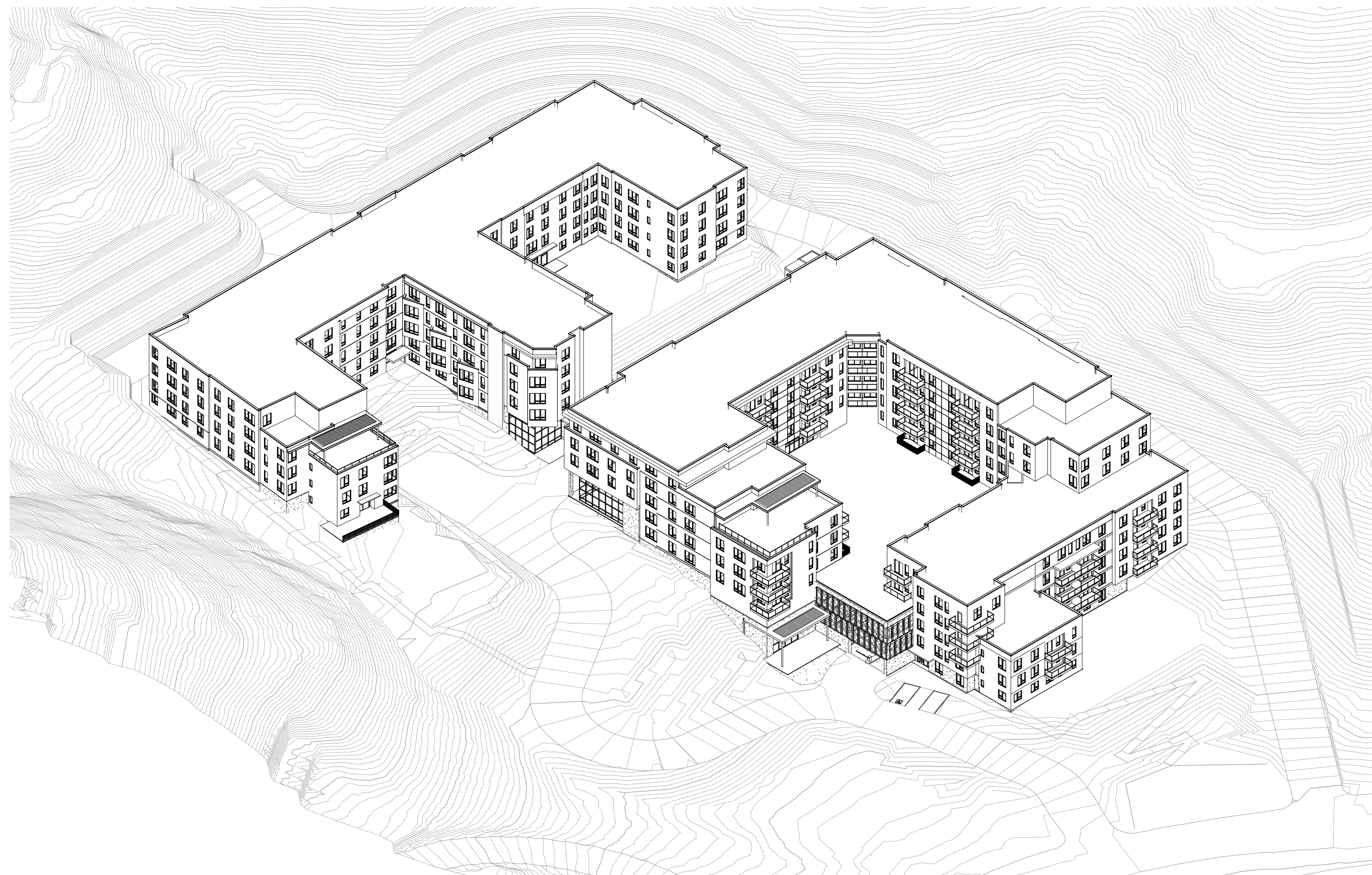
2 SITE MASSING