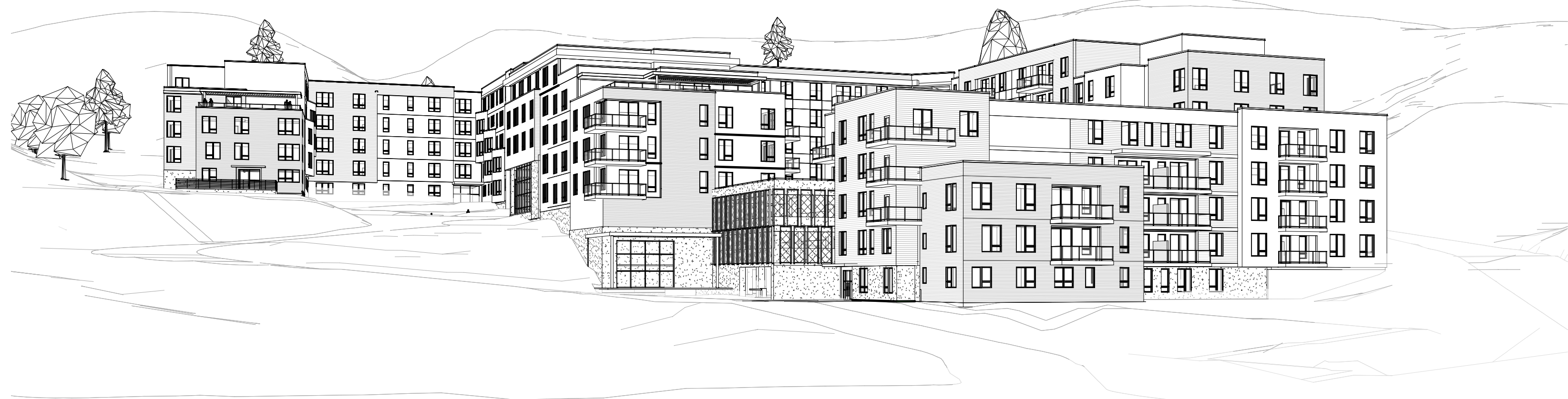
3 View From Southwest