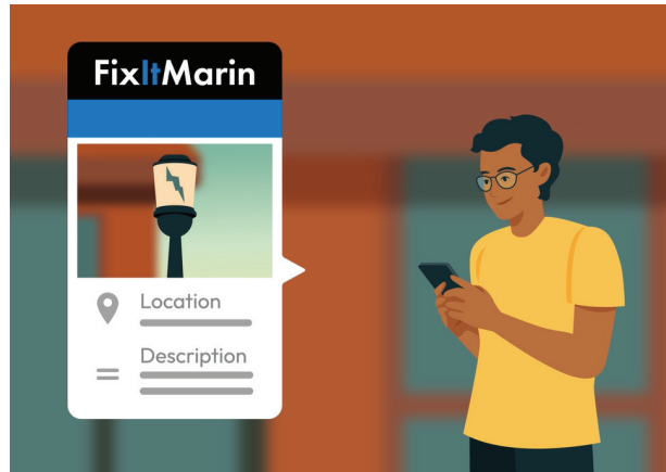
Submitting a ticket on the phone

Alt text to use: A hand holding a phone displaying the FixItMarin logo on the screen.