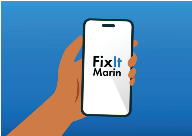
FixItMarin app on phone

Use approved FixIt Marin illustrations for collateral, presentations, newsletters, social media graphics, webpages, and other communications that promote FixItMarin.